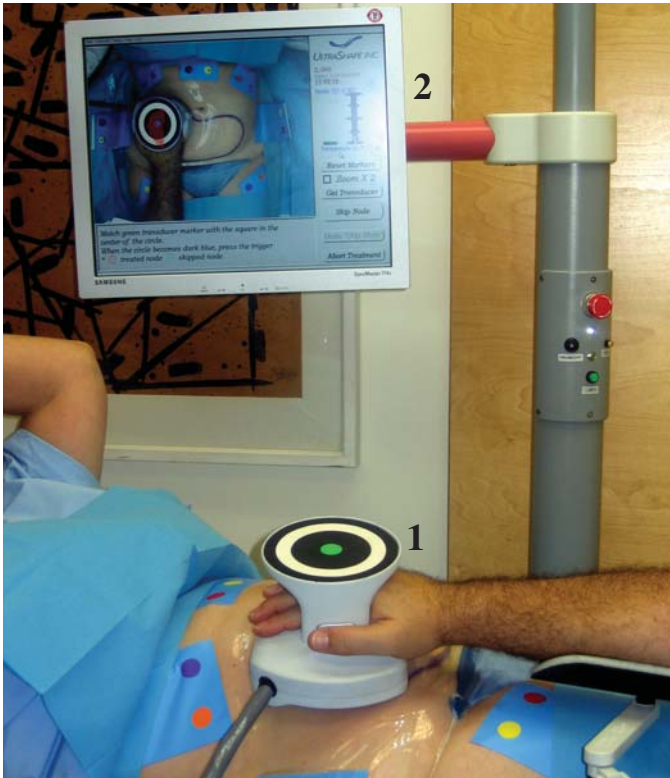
Fig. 1: System components: 1- the treatment transducer; 2- the user interface, showing the treatment area

tracking system records and synchronizes the body's position at which the treatment is to be performed in real-time, according to the pre-mapped calculation of the treatment area. The operator's interface is displayed on the system's LCD. Figure 1 shows the treatment area and the operator's interface, during a typical treatment of the abdomen.